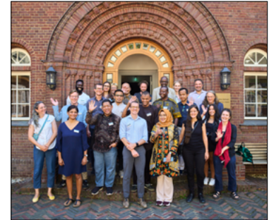
Participants in the conference hall and in front of the entrance