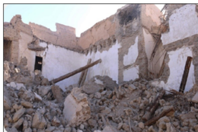
Rubbles of the Ghadames mahkama (qâdî's house, the medieval court of justice).

Academic historical research sometimes not only has to interpret existing and safely preserved historical sources, but also protect them. This is the case with manuscripts and archives of the Libyan city of Ghadames, which are held in buildings bombed during World War II and which the last two decades exposed to new dangers. This 2-year project (starting April 2024), supported by the Patrimonies Funding Initiative of the Gerda Henkel Stiftung and led by Nora Lafi (ZMO) and