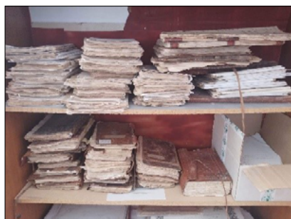
Manuscripts and old books already collected