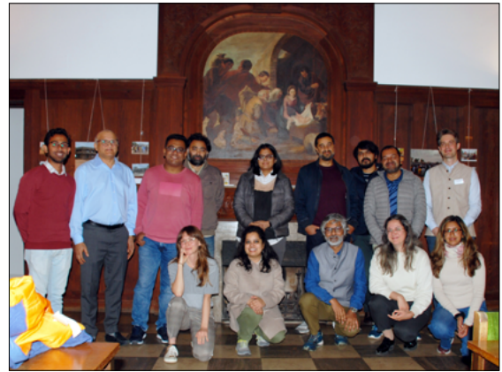
Another suitable place for a picture is ZMO's entrance hall

In the course of discussions, post-colonial South Asian history figured primarily in two presentations. One looked at the use of high-yield variety seeds in post-colonial India by placing it within the context of partition, in which the region of Punjab experienced a loss of agricultural infrastructure equated to a "loss of time". High-yield variety seeds, with their promise of ensuring food supply in the near "future", were thereby seen as a solution. The other was more directly concerned with political questions, primarily because it looked at student movements in late colonial India and early post-colonial Pakistan. It broadly addressed not only