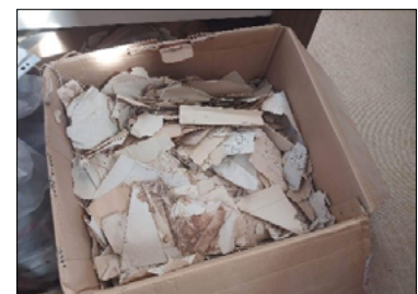
Scrap archives and documents awaiting restoration and cataloguing