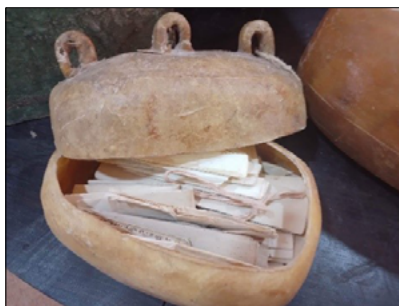
Terracotta box containing and protecting manuscripts and archives

governance in the hands of local civil society, and digitization that allows both stability and accessibility. Interpretation is conceived as combining the knowledge of local civic associations and of scholars active on the international level.