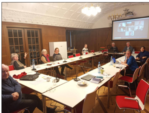
Meeting of the Gesellschaft zur Förderung des ZMO e.V. in November 2023 at ZMO

The annual lecture (organized in cooperation with the Katholische Akademie, the Maecenta-Stiftung, and the Orient-Institut, Beirut) was held on 27 November 2023, at the Katholische Akademie, Berlin. The subject “Werte im Widerstreit – der