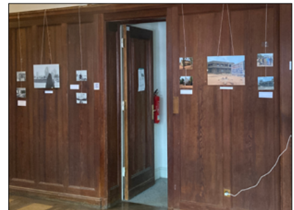
Impressions from the exhibition in ZMO's entrance hall

The Remoboko team organized a photo exhibition as part of its final conference, held at ZMO from 6 to 8 September, 2023 (see p. 5). Concluding five years of a research programme dedicated to religion, morality, and boko in West African public universities, the conference gathered scholars from different regions and academic contexts. The participants examined university campuses as training grounds, moral spaces and political arenas, besides their educational mission. Covering several West African universities in Niger, Nigeria, Benin, Togo, and Senegal, this photo exhibition aims to give some insights into the team members' respective research and field sites, in which religious manifestations are obvious to different degrees. Each member of the Remoboko research group displays five photos in the lobby of ZMO.