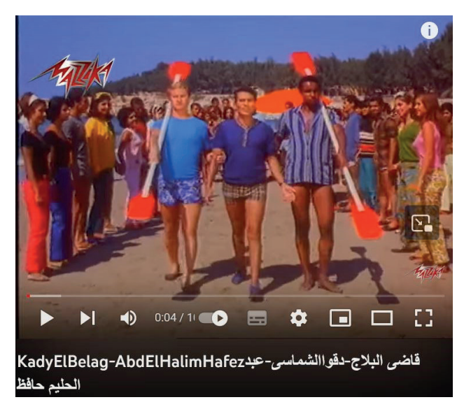
Figure 1. 'Abd al-Ḥalīm Ḥāfiz pleading for his status, in "Qāḍī al-blāğ", 1969 (0'04)

In an Egypt suffering the bitter defeat of 1967, whose repercussions in the national memory and political field are well known,<sup>22</sup> the representation of Egyptian youth cannot express envy or emulation of the young people